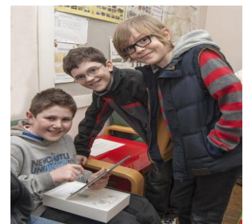
Young people from Bellingham Youth Club try the new ipads provided by Northumbria Police

It is clear from the reaction of the young people that they like their new club. The Police & Crime Commissioner and Chief Constable, Sue Sim, visited the club to present the new ipads and to meet members and volunteers.