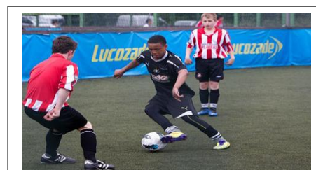
Talented young players at SAFC and NUFC "Kicks" programme

"Using football to get this message across means they engage better and learn more". Both clubs were delighted to join up with the Office of the Police and Crime Commissioner.