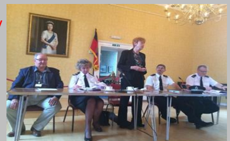
Attending a public meeting in Berwick upon Tweed.