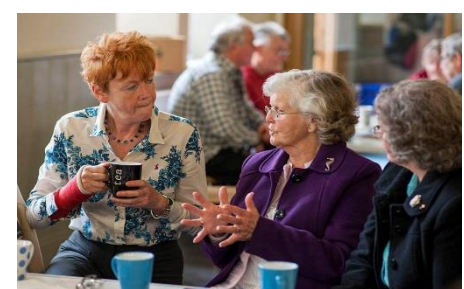
Meeting local Councillors in Killingworth