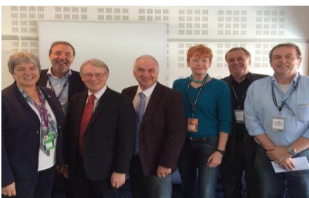
PCCs speaking at a conference fringe event