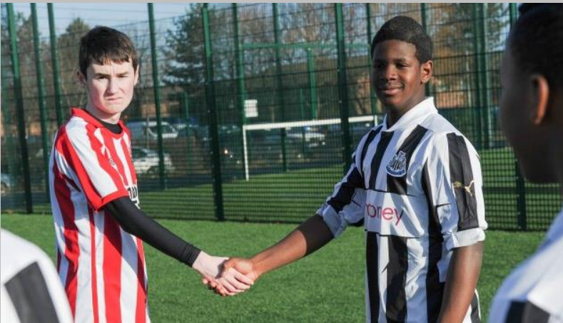
Uniting Newcastle and Sunderland

Anti-social behaviour can be committed by anyone and can have a significant impact on the quality of life for victims. I have used some funding to support the bringing together of Newcastle United and Sunderland football clubs to tackle anti-social behaviour following the violent Derby Day conflicts. The 'Tackle it with Kicks: Building Bridges' project has brought young people together, building positive relationships, reducing youth crime, anti-social behaviour and tensions. Over 350 young people have discussed anti-social behaviour – what it is, the impact it has on them, their families and the communities they live in and knowledge of safe choices. We hope that the long-term outcome will reduce the likelihood of young people being involved in crime and anti-social behaviour, especially football related.