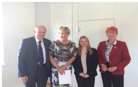
Some of my Complaints team with former Police Minister Damian Green MP