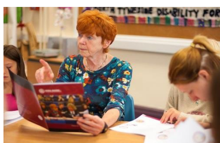
Discussing easy read Police and Crime Plan with disability forum in North Tyneside