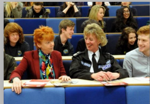
VERA BAIRD QC POLICE & CRIME COMMISSIONER - NORTHUMBRIA

A handwritten signature in black ink, appearing to read 'V. Baird'.