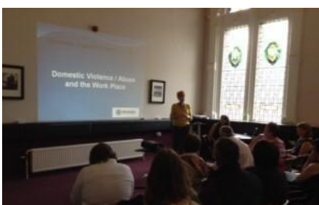
Addressing a Domestic Abuse in the workplace event in Gateshead Old Town Hall