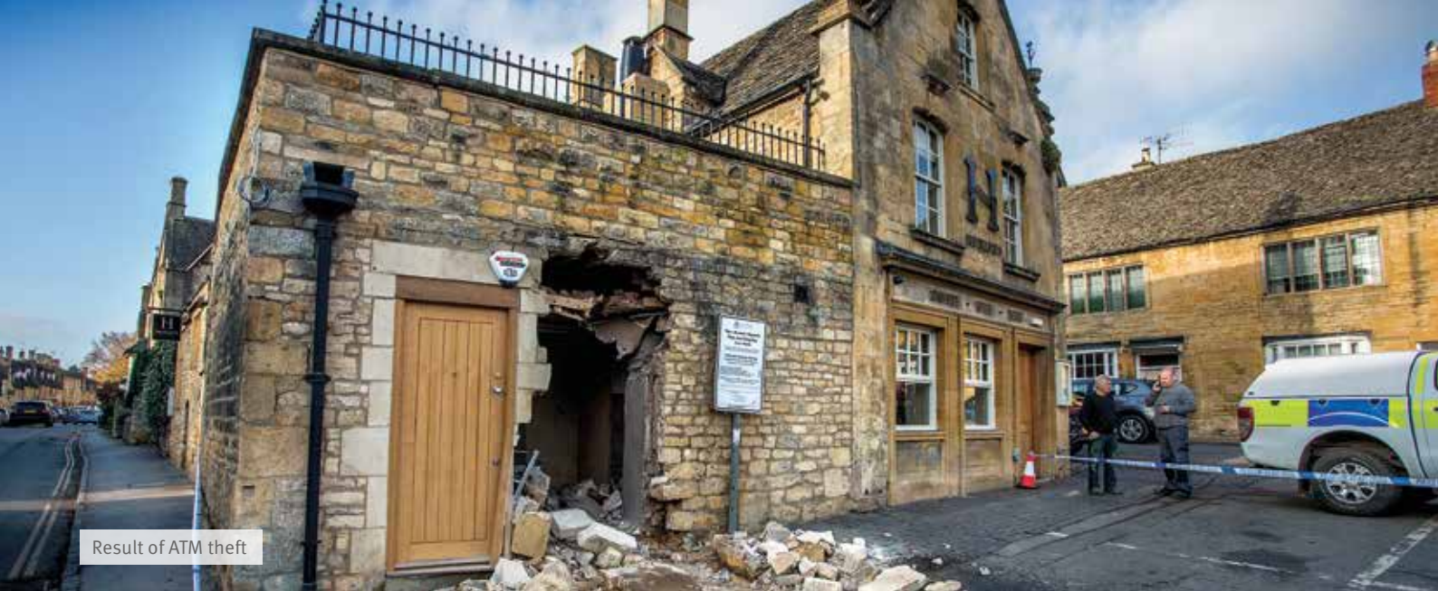
Result of ATM theft